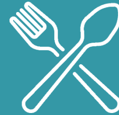
Bar & Restaurant