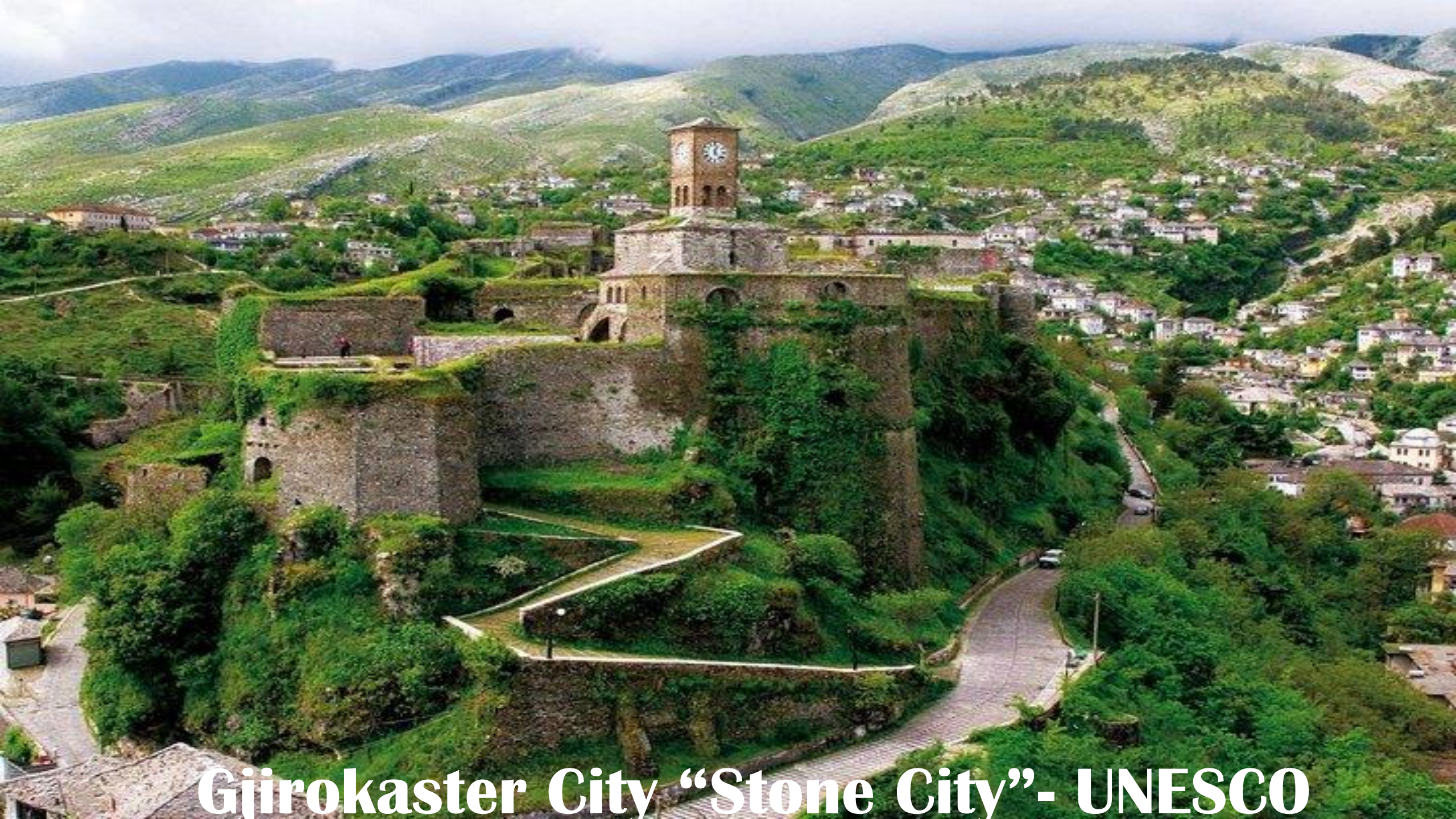
Gjirokaster City “Stone City”- UNESCO